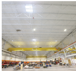
INDUSTRIAL & MANUFACTURING