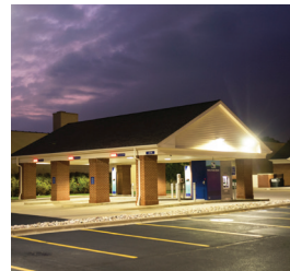
SERVICE & RETAIL